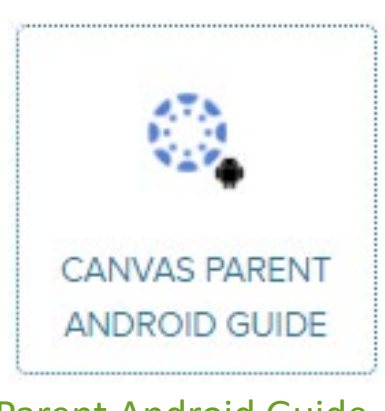
Parent Android Guide