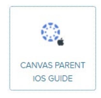
Parent iOS Guide